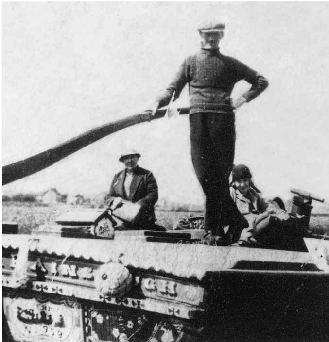
A boatmen wearing a gansey on an Ainscough's boat, c1920, which carried grain between the docks in Liverpool and Birkenhead and the flour mill at Burscough.

This pattern is based upon a gansey now held by the National Waterways Museum in Gloucester. It was knitted in the 1930s by a woman in Bootle who was well-known for her work and is an extremely good example of the canal's style of gansey. To make it easier to knit, the pattern has been converted so that it can be knitted in sections and then sewn together as it is extremely heavy when nearing completion.