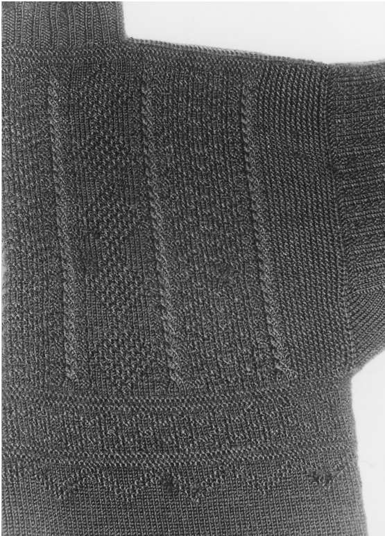
Left and above: Two views of the original gansey in the museum at Gloucester from which this pattern was made.