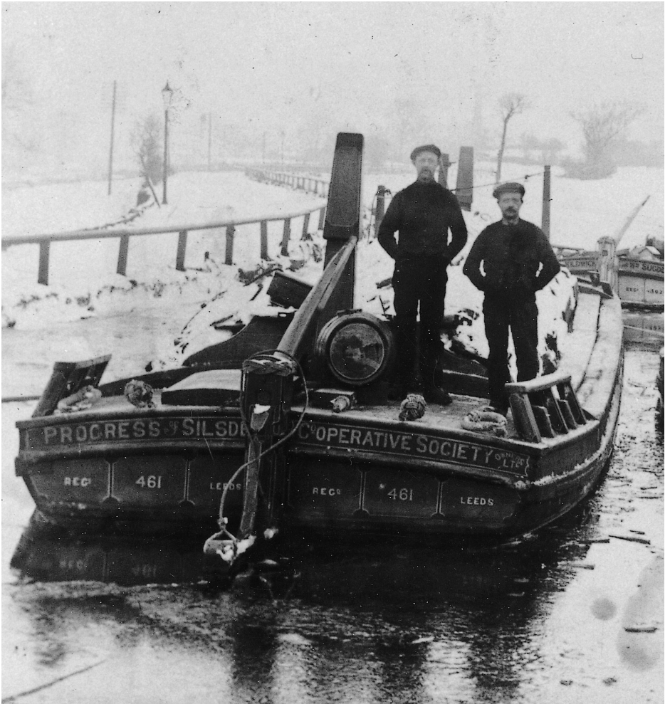
Boatmen on a Yorkshire coalboat iced up at the top of Bingley five-rise locks in the 1930s.

Ganseys were originally knitted using an oiled woollen yarn, but we have replaced this with cotton as this will show up the pattern better. However, the pattern can be used for knitting a woollen gansey.