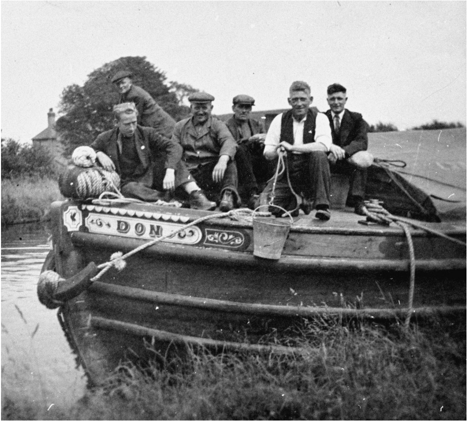
Boatmen on board the boat Don at Crabtree Bridge, Burscough, in the 1930s. A gansey was often too hot in the summer, but was ideal for the open-air life in the winter.